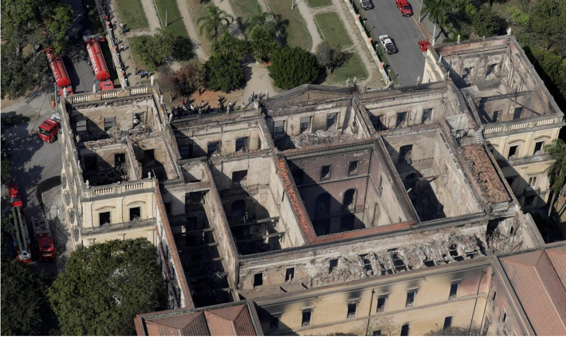
Burned palace 03Aug. 2018